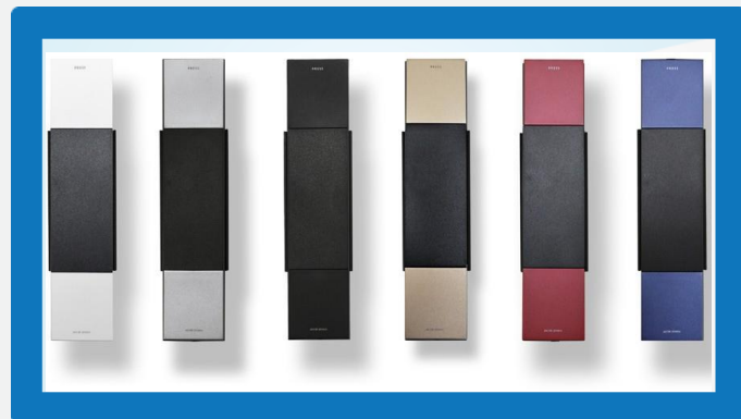
Colour Scheme – Front Plates White, Silver, Black, Champagne Gold, Red, Blue (MOQ applies for Colours Upon Advice)