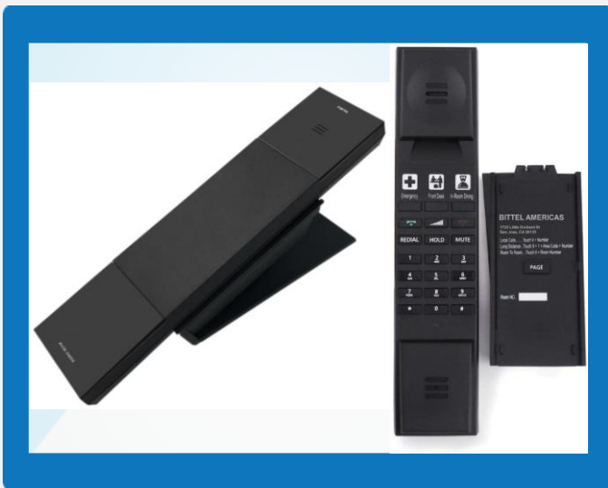
HS20D Cordless Slave Handset